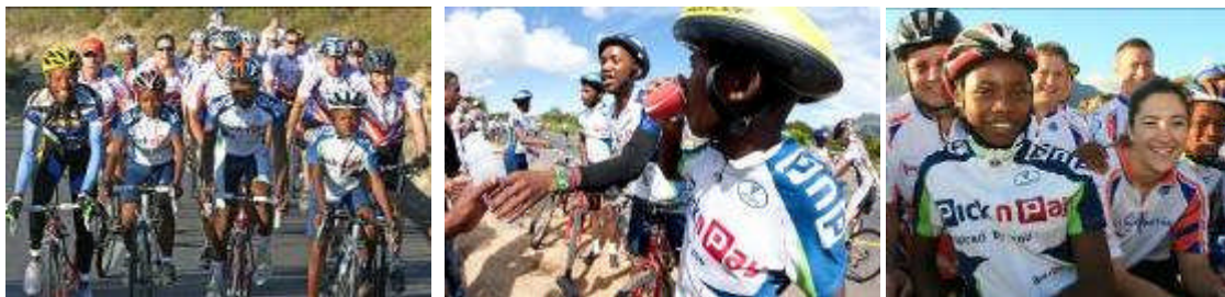
A few of the Safmarine staff, customers and Velokhaya cyclists who competed in this year's Cycle Tour.

Not only did Team Safmarine use the event to raise funds for the upgrade of the Velokhaya BMX Oval, but the Velokhaya cyclists participating in the Tour were given a warm welcome by the 20 Safmarine staff and volunteers who were 'manning' the watering stand at the top of Chapman's Peak.